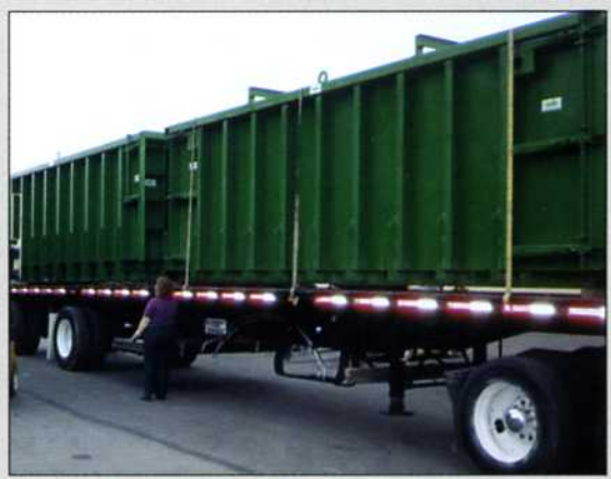
ADJUSTABLE UTILITY VAULT FORM