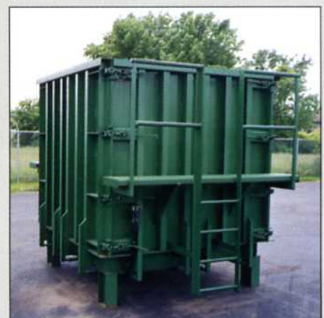
HEAVY DUTY UTILITY VAULT FORM WITH CATWALK

SPILLMAN has been making steel forms for the precast concrete producers for more than 50 years!! We pride ourselves in producing forms which will meet or exceed both you and your customer's goal for QUALITY and DEPENDABILITY!!