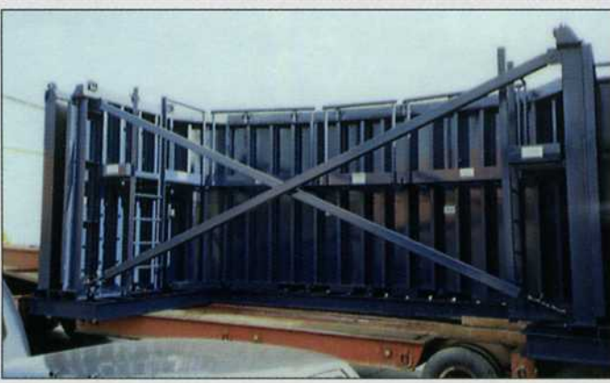
CON SPAN® — 3 SIDED BOX FORM