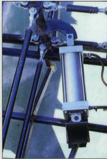
CYLINDER TO COLLAPSE CORE