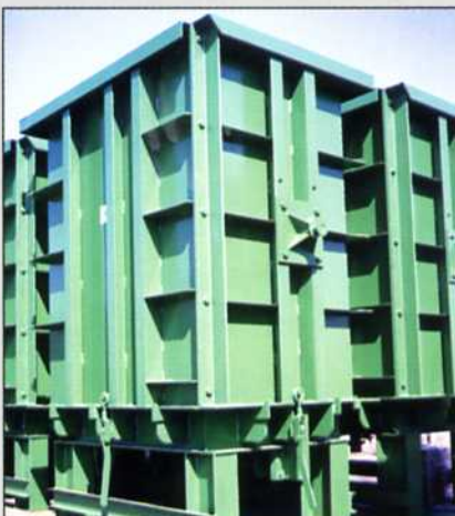
TURNING TRUNIONS FOR "BOLT-ON" WRAPPER

SPILLMAN has been making steel forms for the precast concrete producers for more than 50 years!! We pride ourselves in producing forms which will meet or exceed both you and your customer's goal for QUALITY and DEPENDABILITY!!