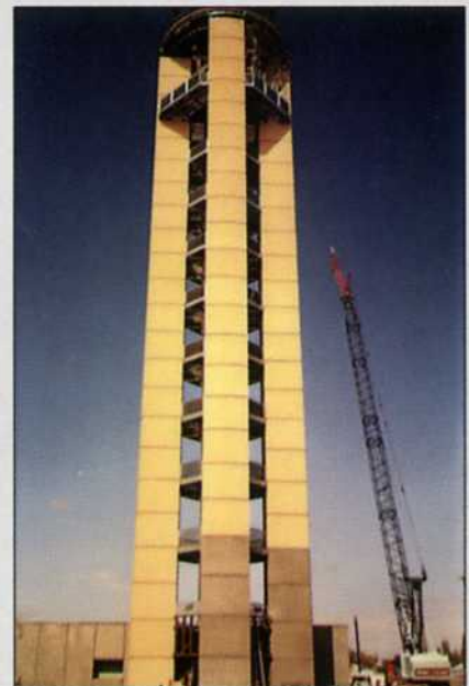
FAA TOWER, ALBUQUERQUE NEW MEXICO