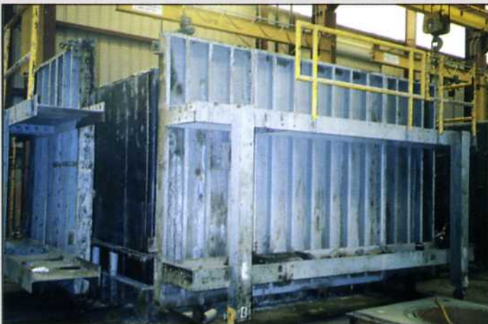
"STRICKLAND" STYLE UTILITY VAULT FORM WITH HYDRAULIC CORE & ROLLAWAY JACKETS

SPILLMAN'S experienced team of design and engineering experts are here to work with you to get everything just right!! Our "state of the art" computer technology can produce CAD drawings for FAST and ACCURATE design of your forming needs.