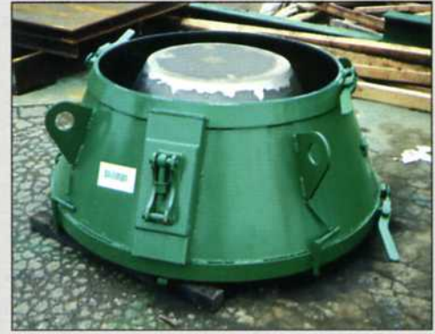
CONCENTRIC CONE FORM WITH CRADLE LUG BRACKETS